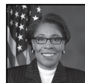
Rep. Marcia Fudge (D-OH)