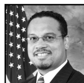
Rep. Keith Ellison (D-MN)