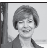
Sen. Tammy Baldwin (D-WI)