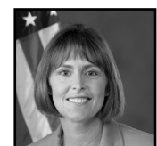
Rep. Kathy Castor (D-FL)