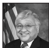
Rep. Mike Honda (D-CA)