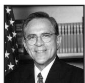
Rep. Rubén Hinojosa (D-TX)