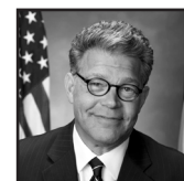
Sen. Al Franken (D-MN)