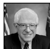
Sen. Bernie Sanders (D-VT)