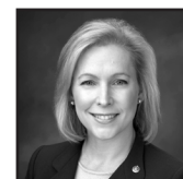
Sen. Kirsten Gillibrand (D-NY)