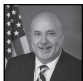
Rep. Mark Pocan (D-WI)