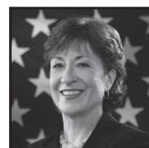
Sen. Susan Collins (R-ME)