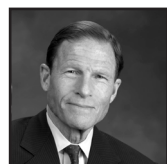
Sen. Richard Blumenthal (D-CT)