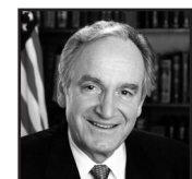
Sen. Tom Harkin (D-IA)