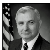
Sen. Jack Reed (D-RI)