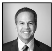
Rep. David Cicilline (D-RI)