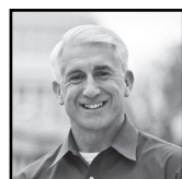
Rep. Dave Reichert (R-WA)