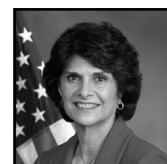
Rep. Lucille Roybal-Allard (D-CA)