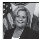
Rep. Ileana Ros-Lehtinen (R-FL)