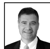
Rep. Chris Gibson (R-NY)