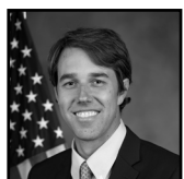
Rep. Beto O'Rourke (D-TX)