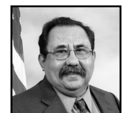
Rep. Raúl Grijalva (D-AZ)