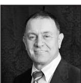
Rep. Richard Hanna (R-NY)