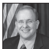
Rep. Jim Langevin (D-RI)