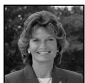
Sen. Lisa Murkowski (R-AK)