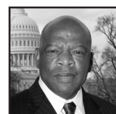
Rep. John Lewis (D-GA)