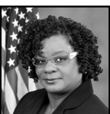
Rep. Gwen Moore (D-WI)