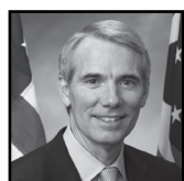
Sen. Rob Portman (R-OH)