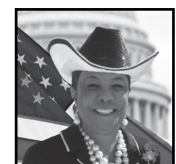
Rep. Frederica Wilson (D-FL)