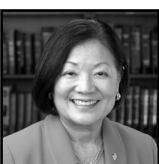
Sen. Mazie Hirono (D-HI)