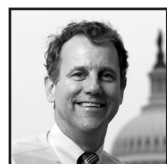
Sen. Sherrod Brown (D-OH)