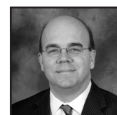
Rep. Jim McGovern (D-MA)