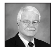
Rep. George Miller (D-CA)