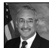
Rep. Bobby Scott (D-VA)