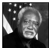
Rep. Danny Davis (D-IL)