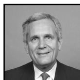
Rep. Lloyd Doggett (D-TX)