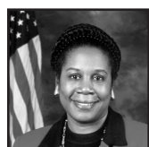
Rep. Sheila Jackson Lee (D-TX)