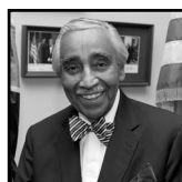
Rep. Charles Rangel (D-NY)