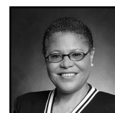
Rep. Karen Bass (D-CA)