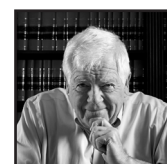
Rep. Jim McDermott (D-WA)