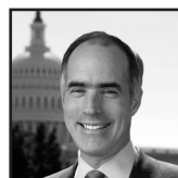
Sen. Bob Casey (D-PA)