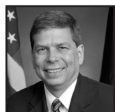
Sen. Mark Begich (D-AK)