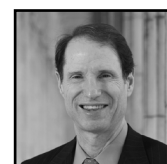
Sen. Ron Wyden (D-OR)