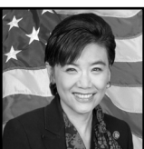
Rep. Judy Chu (D-CA)