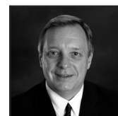
Sen. Richard Durbin (D-IL)