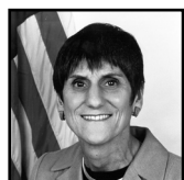
Rep. Rosa DeLauro (D-CT)