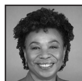
Rep. Barbara Lee (D-CA)