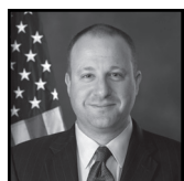
Rep. Jared Polis (D-CO)