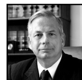
Rep. Gene Green (D-TX)