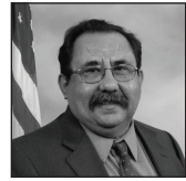
Rep. Raúl Grijalva (D-AZ)