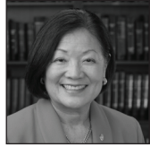
Sen. Mazie Hirono (D-HI)