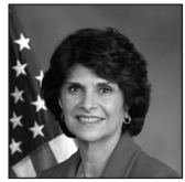
Rep. Lucille Roybal-Allard (D-CA)