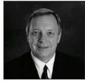
Sen. Richard Durbin (D-IL)