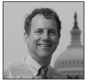
Sen. Sherrod Brown (D-OH)