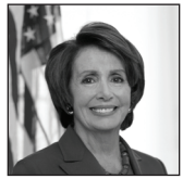
Rep. Nancy Pelosi (D-CA)