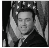
Rep. Michael Grimm (R-NY)