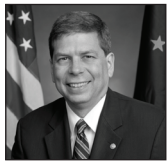
Sen. Mark Begich (D-AK)