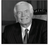
Sen. Thad Cochran (R-MS)