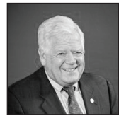
Rep. Jim McDermott (D-WA)