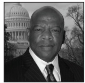
Rep. John Lewis (D-GA)