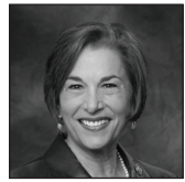
Rep. Jan Schakowsky (D-IL)