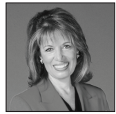
Rep. Jackie Speier (D-CA)