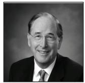
Sen. Jay Rockefeller (D-WV)