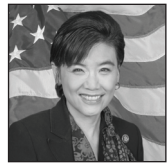
Rep. Judy Chu (D-CA)