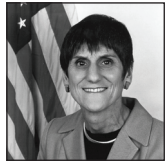
Rep. Rosa DeLauro (D-CT)