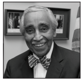
Rep. Charles Rangel (D-NY)