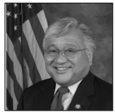
Rep. Mike Honda (D-CA)