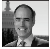
Sen. Robert Casey (D-PA)