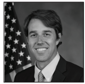
Rep. Beto O'Rourke (D-TX)