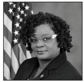
Rep. Gwen Moore (D-WI)