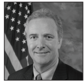
Rep. Chris Van Hollen (D-MD)