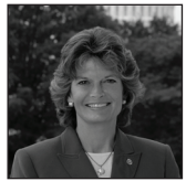
Sen. Lisa Murkowski (R-AK)