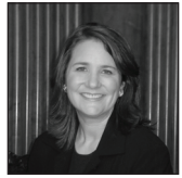
Rep. Diana DeGette (D-CO)