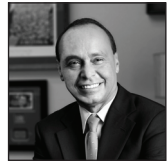
Rep. Luis Gutiérrez (D-IL)