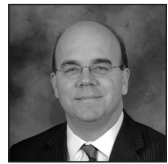
Rep. Jim McGovern (D-MA)