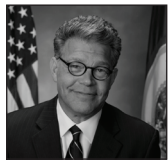
Sen. Al Franken (D-MN)