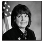
Rep. Betty McCollum (D-MN)