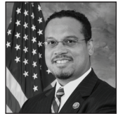
Rep. Keith Ellison (D-MN)