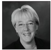
Sen. Patty Murray (D-WA)