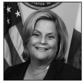
Rep. Ileana Ros-Lehtinen (R-FL)