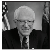
Sen. Bernie Sanders (I-VT)