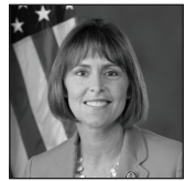
Rep. Kathy Castor (D-FL)