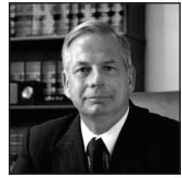
Rep. Gene Green (D-TX)