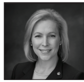
Sen. Kirsten Gillibrand (D-NY)