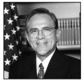
Rep. Rubén Hinojosa (D-TX)