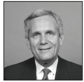
Rep. Lloyd Doggett (D-TX)