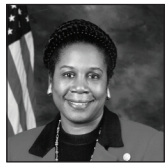
Rep. Sheila Jackson Lee (D-TX)