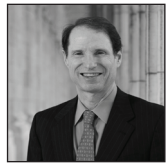
Sen. Ron Wyden (D-OR)