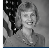
Rep. Lois Capps (D-CA)