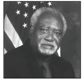
Rep. Danny Davis (D-IL)