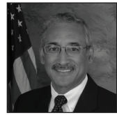
Rep. Bobby Scott (D-VA)