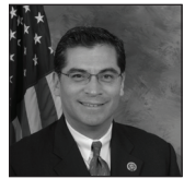
Rep. Xavier Becerra (D-CA)