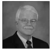
Rep. George Miller (D-CA)