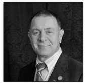
Rep. Richard Hanna (R-NY)