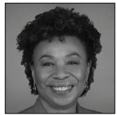
Rep. Barbara Lee (D-CA)