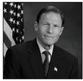
Sen. Richard Blumenthal (D-CT)