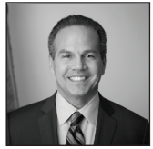
Rep. David Cicilline (D-RI)