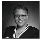
Rep. Karen Bass (D-CA)